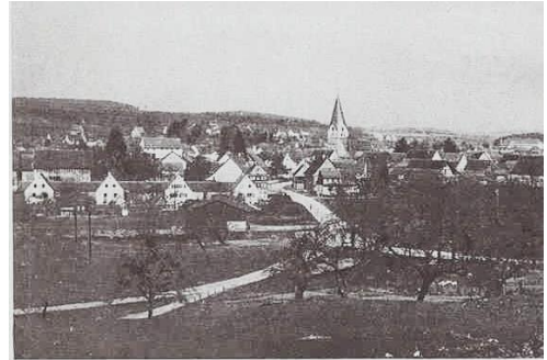
Faurndau am Fils