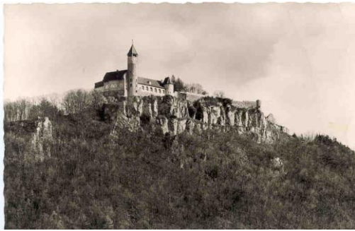
Kirchheim unter Teck